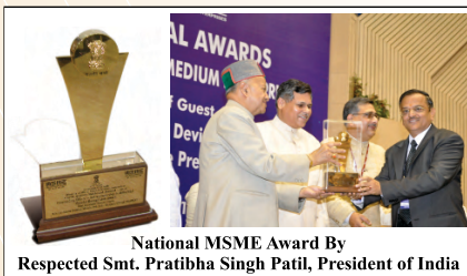
National MSME Award By Respected Smt. Pratibha Singh Patil, President of India