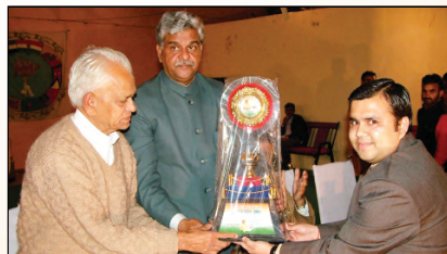
By Respected Shri Sriprakash Jaiswal, Ex. Coal Minister, Government of India