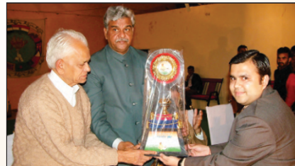
By Respected Shri Sriprakash Jaiswal, Ex. Coal Minister, Government of India