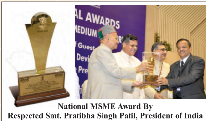
National MSME Award By Respected Smt. Pratibha Singh Patil, President of India